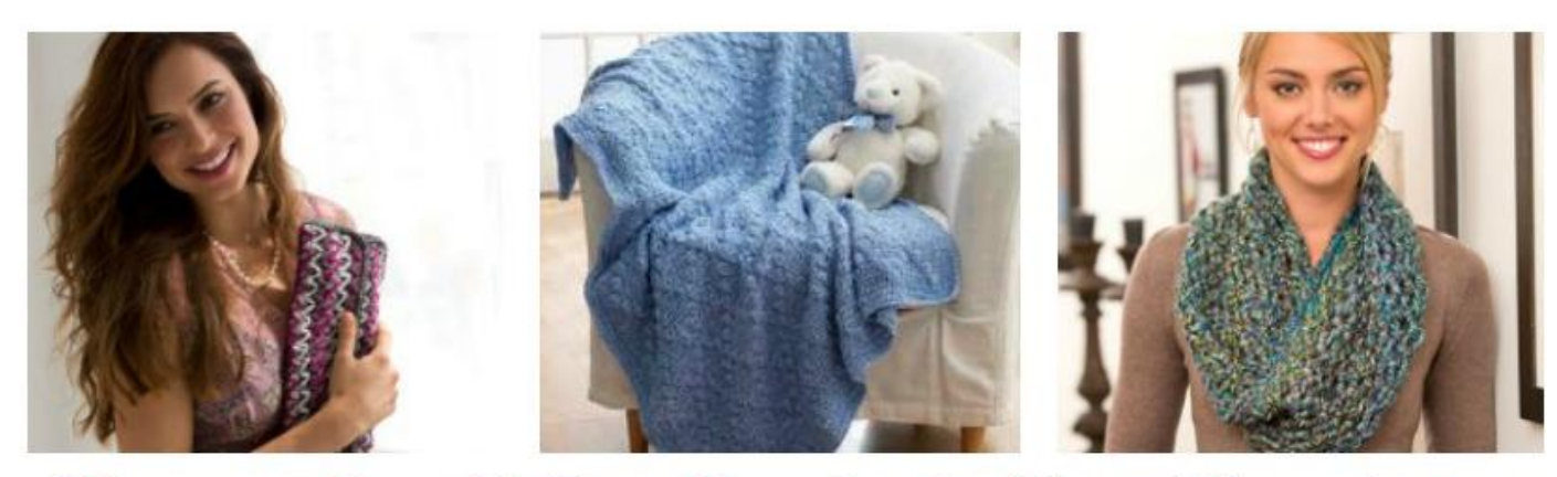
Sign up for All Free Crochet's Free Newsletter