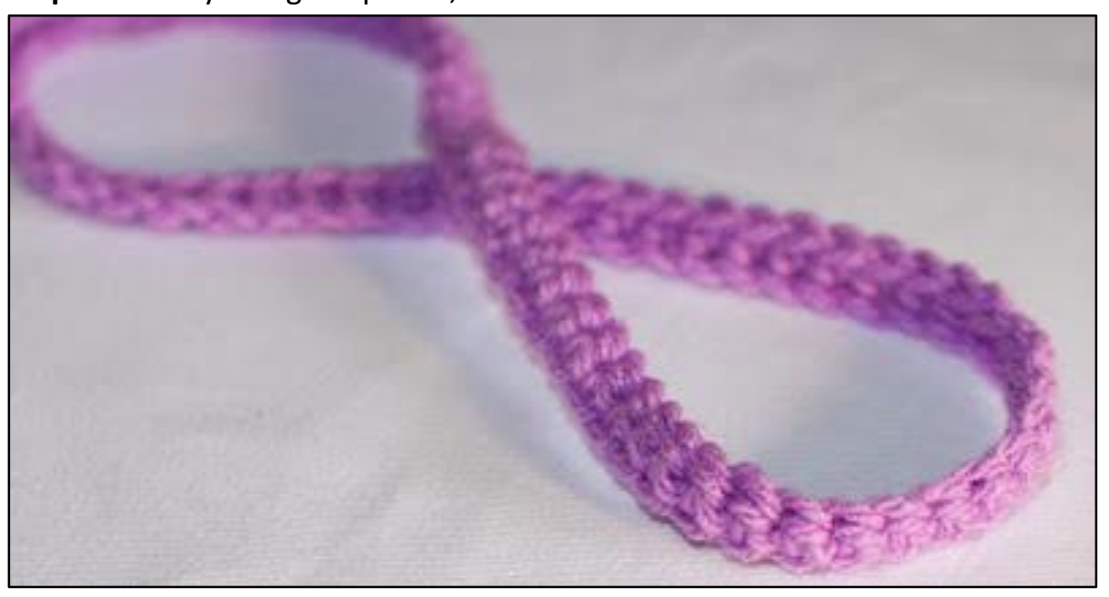
Step 1. Start by doing a slip knot, then crochet 70 chain stitches.