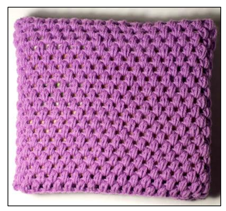
Step 6. Now it's time to get started on the strap. Make 6 chain stitches.

Step 5. After making 19 rows of puff stitches, end it off. Then, taking your wool needle, sew together the bottom of the 'round pouch'.