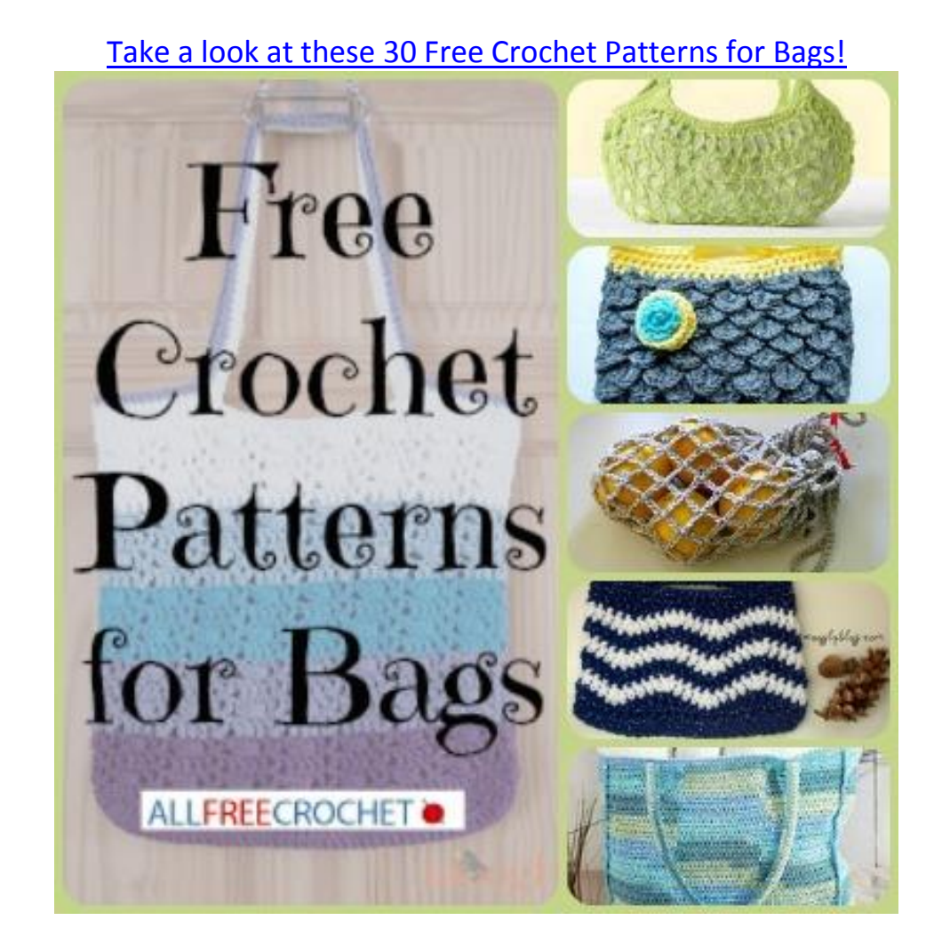
AllFreeCrochet Page | 30

Place RS of Halves tog. Working through both thicknesses, work 1 row of sc across final rows to join. Fasten off.