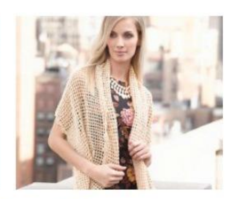
Sign up for All Free Crochet's Free Newsletter