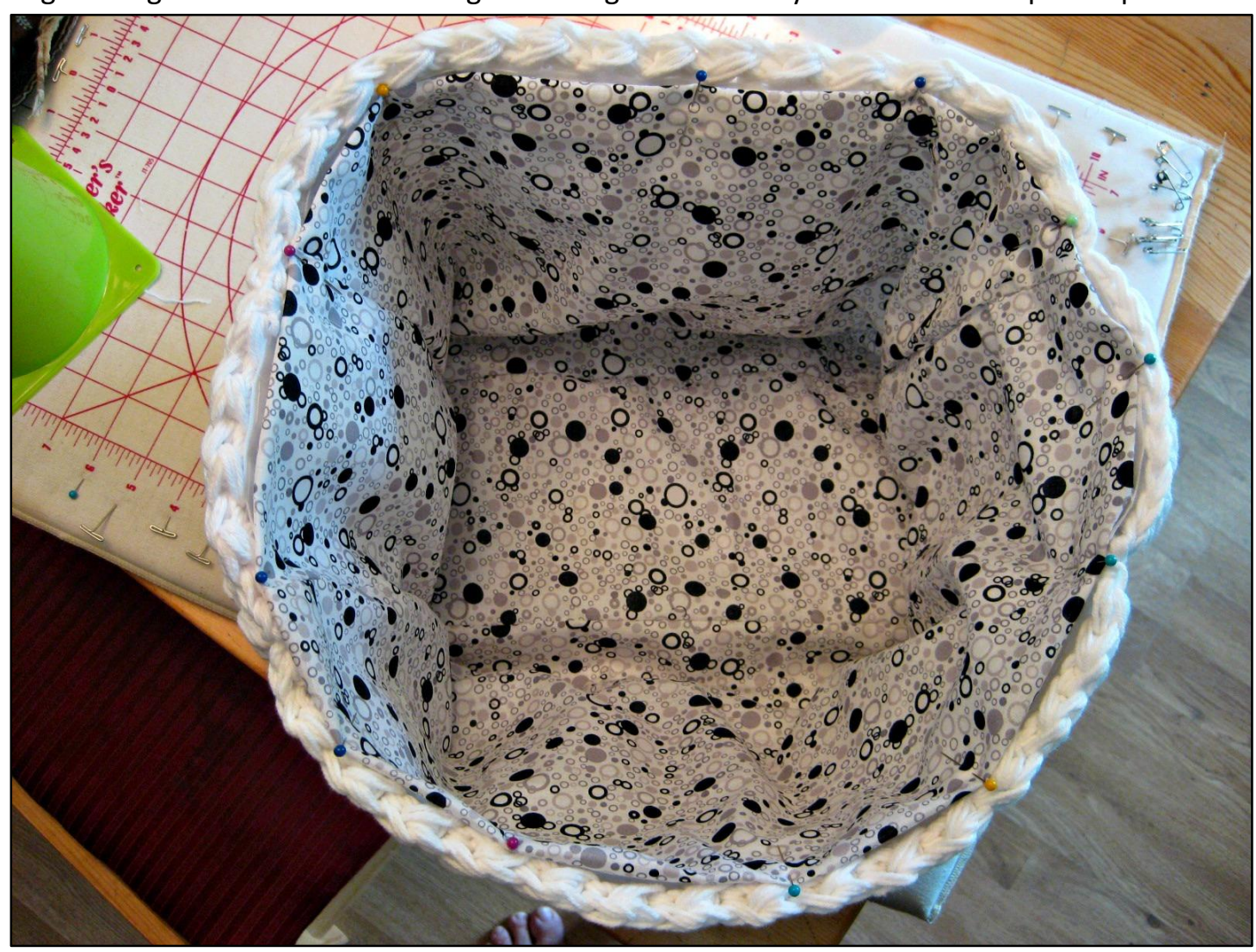
To attach handles, use bias tape to secure them in place.

To attach lining, fold down ½" on top, press with iron if desired, and pin to top of crocheted bag with right side of fabric showing inside bag. Here it ready to be sewn with pins in place: