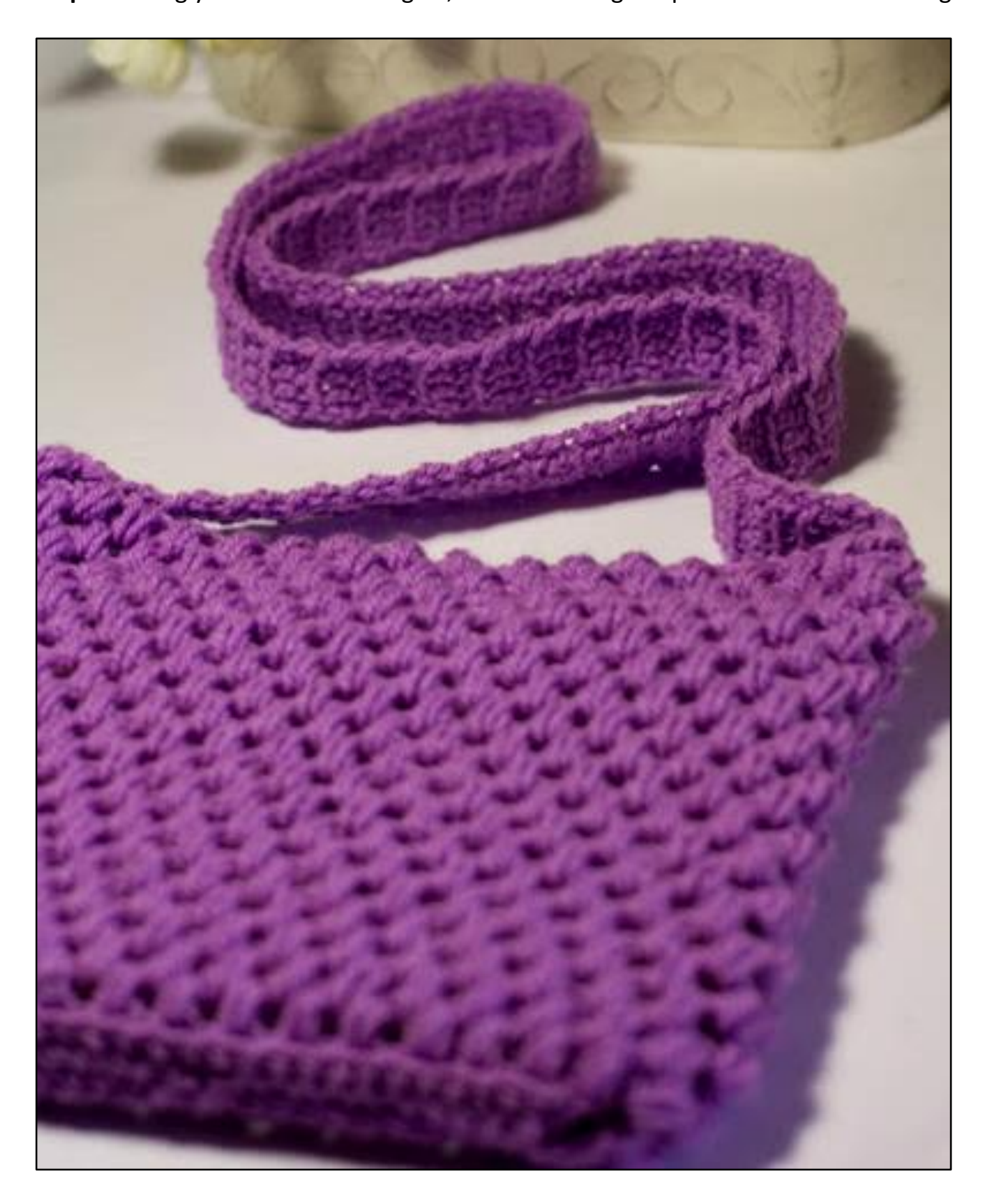
Step 8. Taking your wool needle again, attach the long strap to either side of the bag.