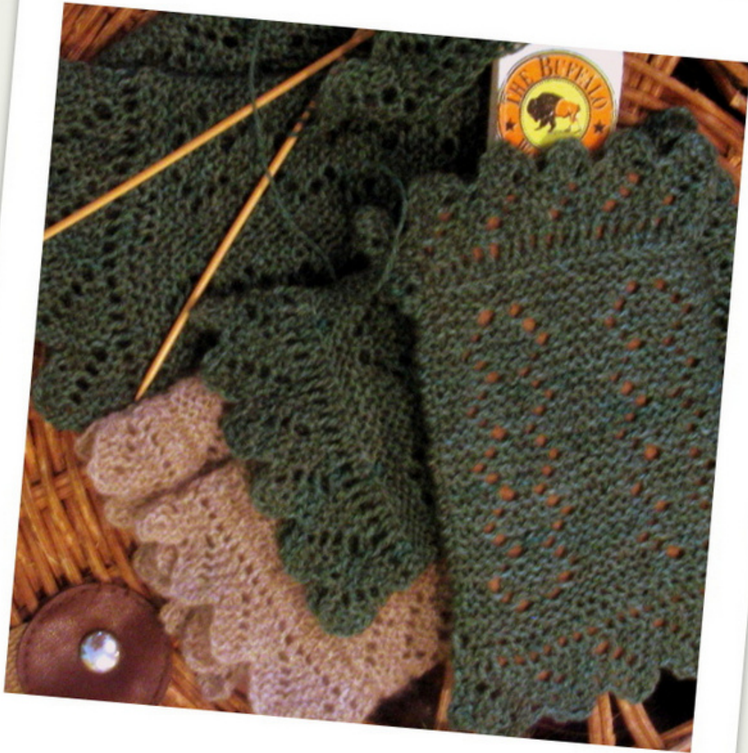
Bison Down Wrist Warmers