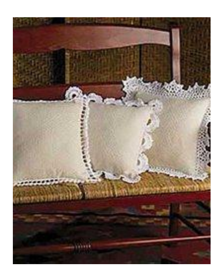
Pillow Edgings

Give your pillows a makeover with these pretty Pillow Edgings! This intermediate crochet pattern features four different edging options: picot, tassel, ruffle, and lace. Use a steel crochet hook and Bernat crochet cotton to complete these patterns.