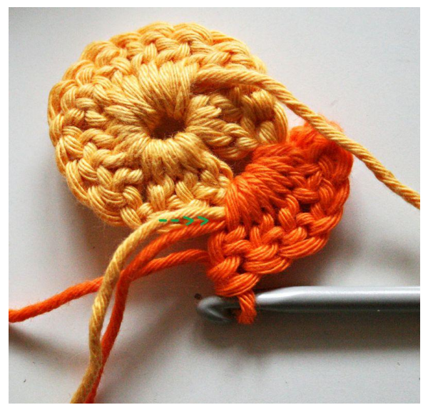
This is how the back of my work looks like. See the arrow? There are the 2 loose ends coming out. You only need to cut them off, and HURRAY those are done already (believe me, working in ALL those loose ends when you've finished your crochetwork is dreadful.