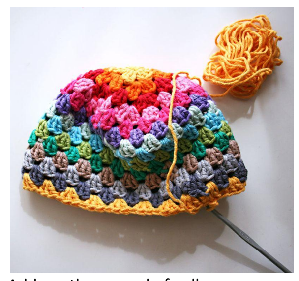
Add another round of yellow.