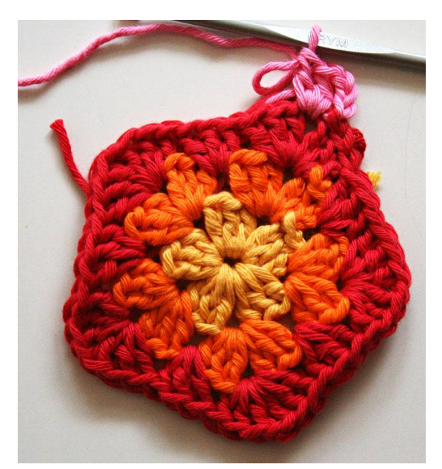
Chain 3 with your new lovely pink yarn and add 2 more dc's to finish the

I know this doesn't look like a hat or a circle AT ALL. It's okay. Just trust me and keep moving. Again, join in the second dc of the first set of 3dc's (see my hook) and slip stitch your way into the next chain-1-open space. Remember: change color! (the red yarn has a total of 15 set's of 3dc's).