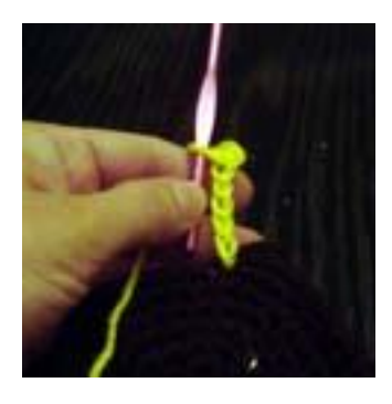
Step 3: SC in the next stitch