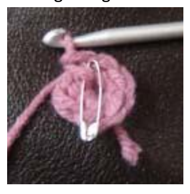
Row #2: 2 SC in each stitch, total = 12 stitches in this row.