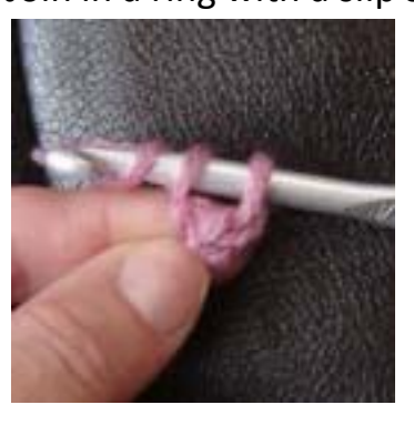
Here is the ring – the beginning of the hat!