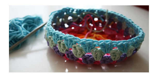
Ahhh it's starting to transform as a bowl. How lovely. So now you get to the bright blue / aqua and crochet

Onto the next row. I chose a light blue/greenish color. Again: crochet 1 set of 3 dc's in each chain1-open space and join with a slipstitch. My hat is upside down, obviously, and you can see it's getting some shape. This size will fit most children and even some adults (yes, my head isn't that big!). If you have a bigger head (or your familymembers are bigheaders), you simply need to make your hat wider by adding more sets of 3 dc's into the game. Measuring is key.