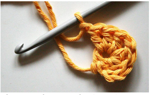
After your first set of 3 dc -> chain 1, and than add another 3 dc's to the party.