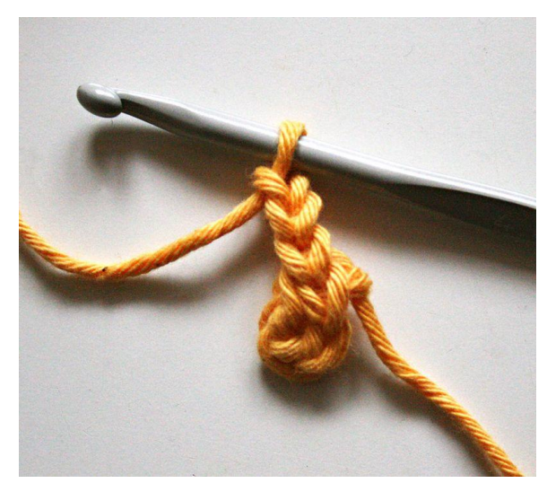
Now we are starting with the first round. Chain 3. (These count as your first dc :)