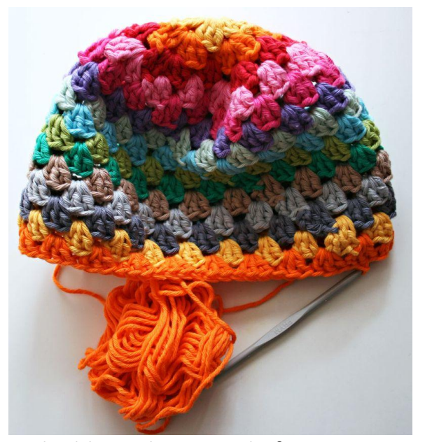
And add another round of orange.