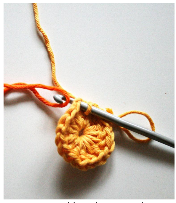
Now we are adding the new color.