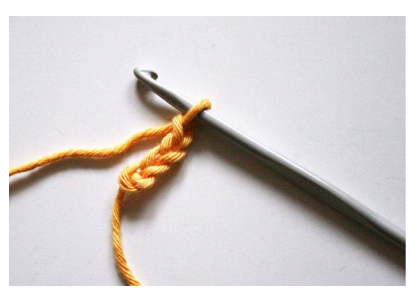
I started with yellow. Obviously. Make a chain of 4.