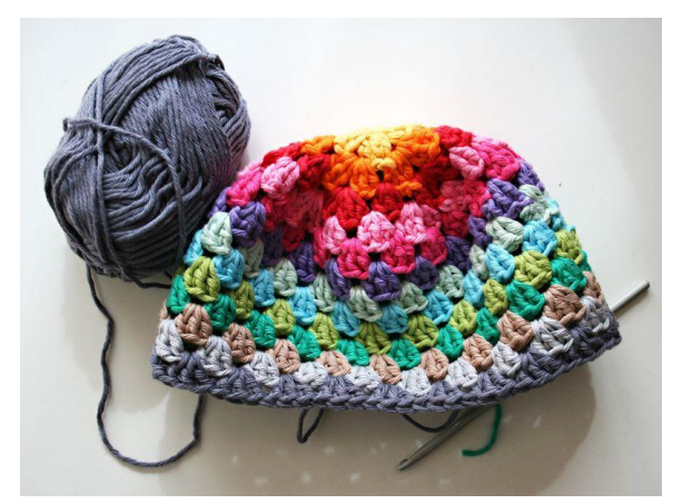
And another round with darker grey. I am such a sucker for rainbows. Or anything brightly colored.