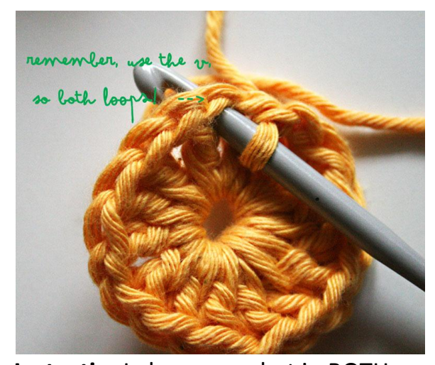
Just a tip: I always crochet in BOTH loops, unless i tell you something else. Watch closely. See the V? Those are the 2 loops you want to have on your hook. YES you do.