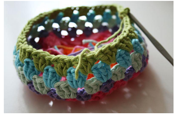
Another round, now with light green.

another round of 1 set of 3 dc's in each open chain-1 space all around. Chain 1 and move to the next space. Join with a slipstitch.