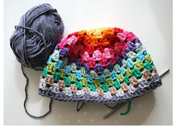
Let's go back to your dark grey round as your last round.