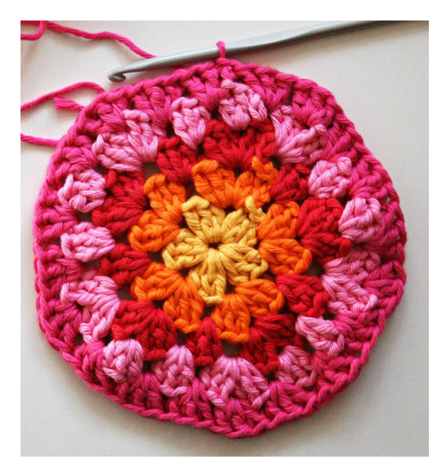
Now we add a bit darker pink. The pattern for the sets is: crochet 7 sets of 3dc's in the next 7 open chain-1-

Wow, it truly is beginning to look like a circle. I told you! Just keep counting. (The pink yarn has a total of 20 set's of 3dc's). Join exactly the way you did before, slipstitch your way into the next open chain space and change color.