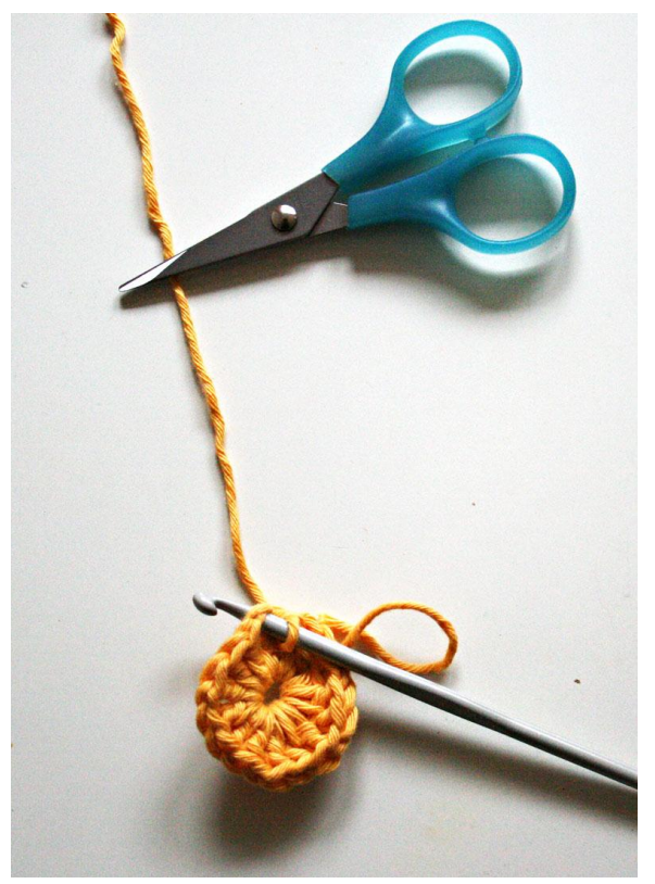
Make sure you have some length and then cut off. We are going to introduce a new color.