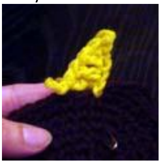
Repeat Steps 1-7 for each petal around the brown center of the sunflower.

of the brown center. The first petal is ready!