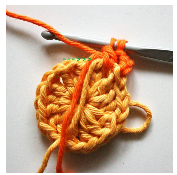
Make another 2 double crochets to 'finish' your first set of 3 double crochets. But look closely: try to weave in those loose ends AS YOU GO. I just hold my loose ends tight