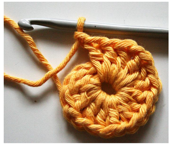
And chain 1 again. Then add 3 more sets of 3dc's, chain 1. In total you have 5 groups of 3 dc's (all separated by one chain).