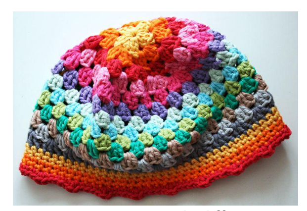
TAKE NOTE: Now I made different finishes / edges for 2 rainbow beanies. The one above: when you are finished with your last grey round (if the head is bigger, you might want to add another round or 2. I picked up the lovely yellow color and crochet 1 single crochet in every stitch of the darker grey round. So 1 single crochet in every set of 3 dc's, but also 1 single crochet in the chain 1 space between. that stitch can be a bit itsy-bitchy:), but you'll manage. The first round is always the hardest

With yellow: Crochet 2 rounds of single crochets in each stitch