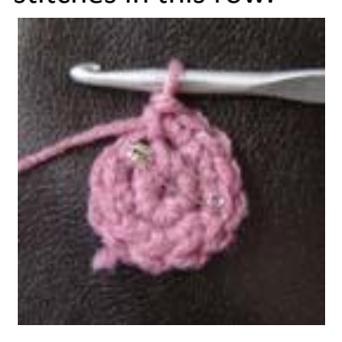
Row #3: [SC, 2SC]. Repeat [ ] 6 times around the row, total = 18 stitches in this row.