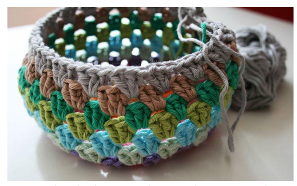
Onto the light grey! Another round.

Still with me? Don't give up! So, on with the light brown! Another round.