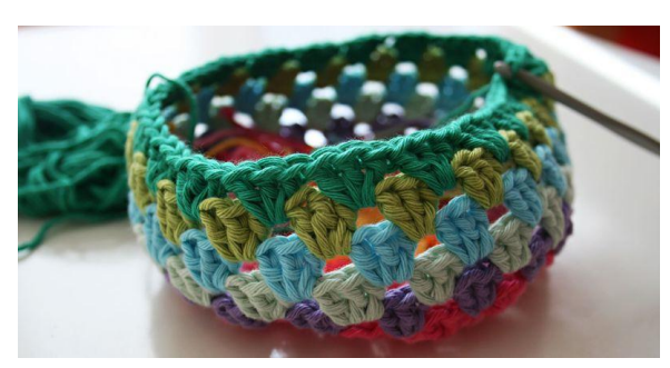
Wooheee ANOTHER round, now take the darker green.

Still with me? Don't give up! So, on with the light brown! Another round.