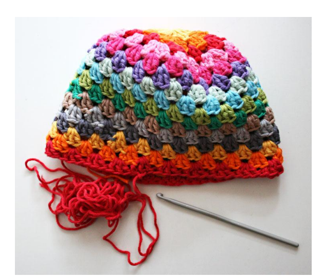
And add another round of red. I love how the bright yellow, orange, red combination peaks out on the bottom again. Love love love.