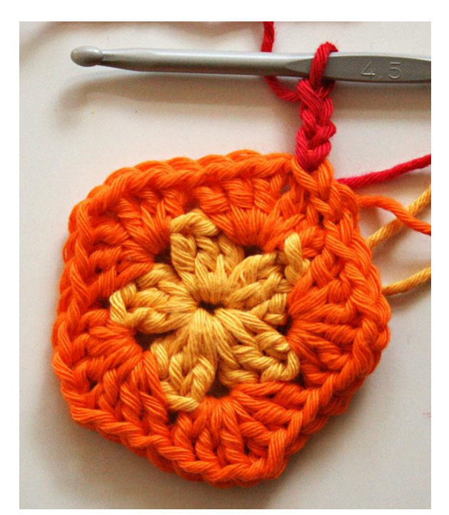
Slip stitch your way until you reach the first chain-1-open space again. I changed color again (Remember:

Finish this round. I've got 10x 3dc's. So the first row (yellow) has 5 sets of 3dc's. The next row (orange) has 2 sets of 3dc's in each open chain-1-space: so 10 sets of 3dc's. Now join in the second dc of the first set of 3dc's (see my picture above).