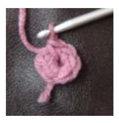
Attach the stitch marker to indicate the beginning of the row.