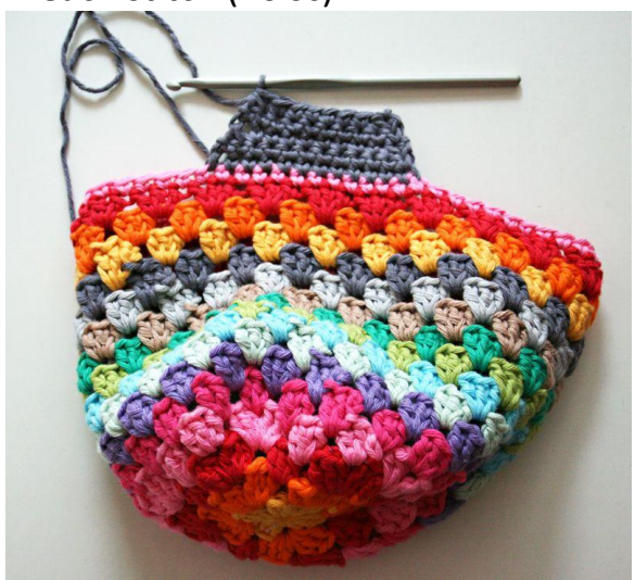
5. We are increasing again. We are going from 10 to 8: single crochet 2 together, crochet 6 single crochets in