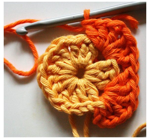
After your last set of 3 dc's, chain 1 and move to the next chain-1-space. here we are going to make another set of: 3dcs, chain 1, 3dcs.