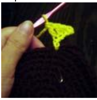
Steps 5-6: DC, DC