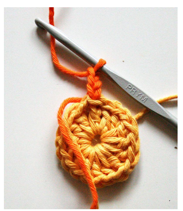
With your lovely bright new color, chain 3 (which, you guessed it already, will count as a first double crochet).

Now the new color is on. But remember: the loose ends are still very loose. So if you are going to continue crocheting, make sure you hold those ends tight as you go now. Especially the first few stitches you make, make sure you pull on tidy. Otherwise you have some holes in your work you do not want to have. Trust me on this.