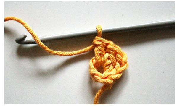
Now crochet 2 more dc's INTO the ring to make a lovely set of 3 dc's in total.