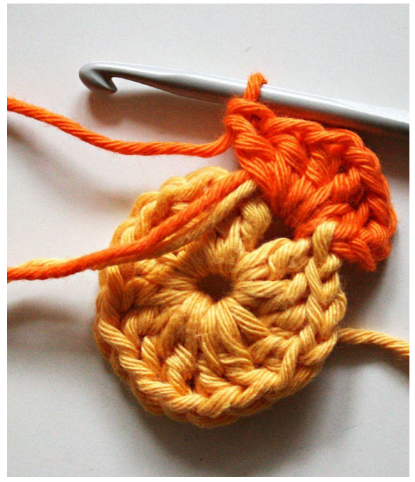
After that first set of 3 double crochets: chain 1 and another 3 double crochet IN THE SAME CHAIN-1-SPACE from the yellow round (you see: I still have my loose ends in between, now it's time to cut them off).

and crochet 'around' them if you know what I mean. That way, they are nice tucked away under your work.