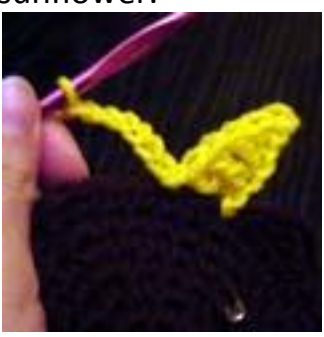
Note: When you finish the last petal, cut off the yellow yarn leaving approximately 15 in (38-40 cm) - you will use it to sew the sunflower on.

Sew the sunflower to the top of the hat.