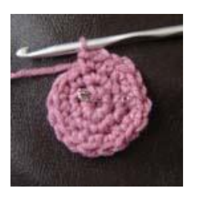
Row #4: [SC 2, 2 SC] Repeat [] 6 times around the row. This means: make a SC in the first stitch of the row, make a SC in the second stitch of the row, make two SCs in the third stitch of the row and repeat this pattern 5 more times. The total = 24 stitches after completing of this row.

Row #5: [SC 3, 2 SC] Repeat [] 6 times around the row. Total = 30 stitches after completing of this row.