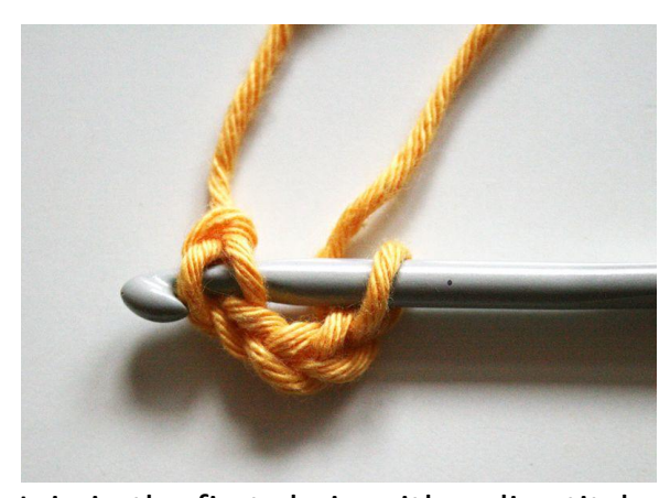
Join in the first chain with a slip stitch to form a ring.