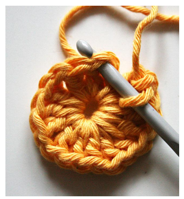
Join your first round into the top stitch of the first chain 3 (remember that one we counted as our first dc), BUT DO NOT SLIP STITCH. Just put your hook through. We are going to change color!! Watch me: