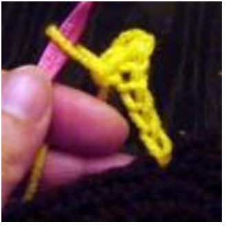
Step 4: DC in the next stitch