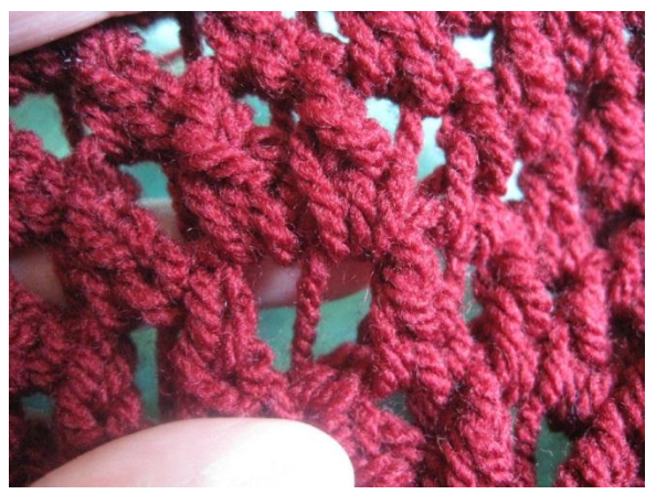
**Above shows you what it looks like to increase for the rest of your project, Put 1 butterfly stitch in each wing of the butterfly from the previous round.