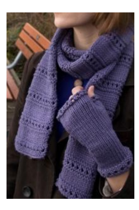
Finished size: Approximately 6.5 x 80 inches (instructions given for modifying dimensions)

Learn how to knit this gorgeous beginner Montgomery Scarf with free knitting patterns. Keep warm and trendy with a homemade scarf.