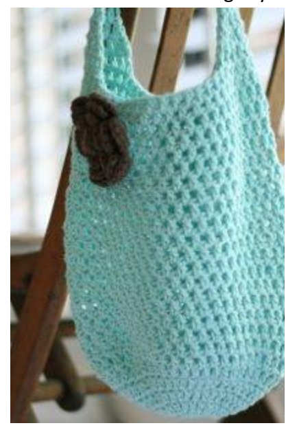
Two Hour Tote

If you have a few hours to spare, then you can complete this Two-Hour Tote pattern. This free crochet design is just the right size for kids to use and is great to carry to the farmer's market during the summer. Add a cute flower or bow embellishment to personalize the look of this homemade tote bag. It could also be used as a yarn storage bag; it's just the right size to fit a few skeins of cotton weight yarn.