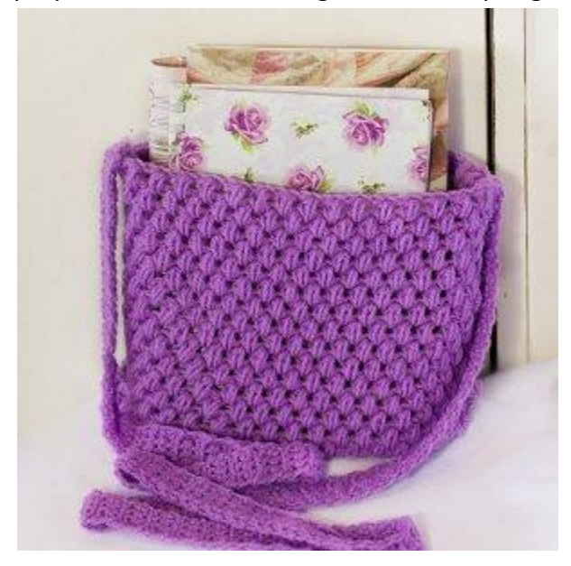
Pretty Purple Purse

Ladies, treat yourself to a new bag with this free crochet pattern. The Pretty Purple Purse is a great addition to your purse collection. It's the perfect size for everyday use. This casual looking bag is made using the puff stitch and can be made in any color yarn that you prefer. The pretty purple hue shown here is great for the spring and summer months.