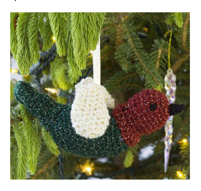
Bird is 7" long from tip of beak to tip of tail.