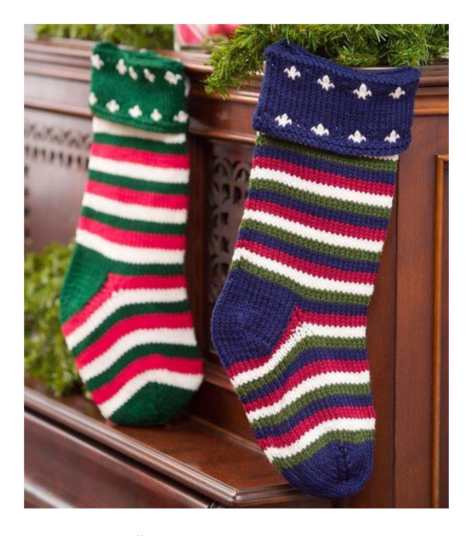
Stocking is 18" long.