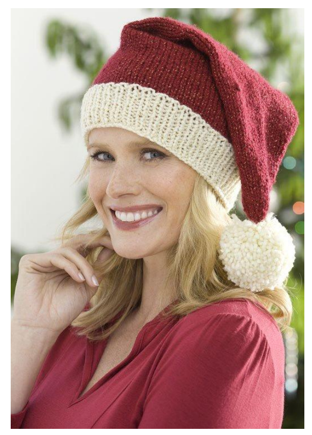
Head Circumference: 18 (20)". Directions are for Adult S/M; changes for Adult M/L are in parentheses.